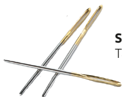
SE041C018 Tapestry Needles