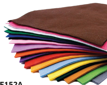
TE152A Felt Square Packs