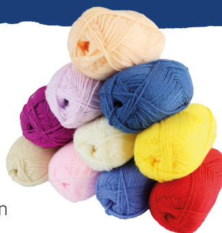
YW019B Acrylic Yarn