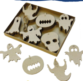
CR698 Halloween Cut Outs