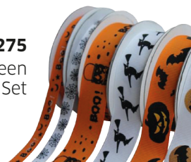
CR275 Halloween Ribbon Set