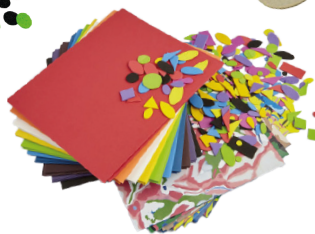
CR096 Craft Foam Class Pack