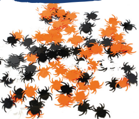
CR712 Halloween Confetti