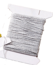
CR300A Metallic Elastic