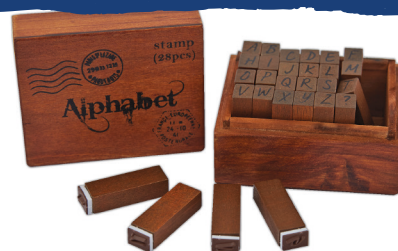
PM464 Wooden Alphabet Stamps