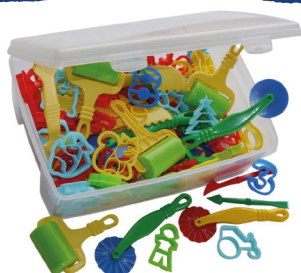
PM590 Modelling Tool Tub