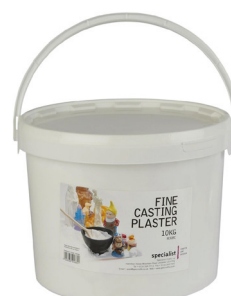
PM308C Fine Casting Plaster