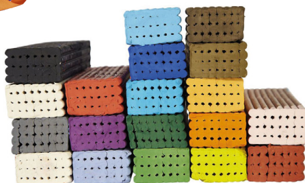
PM411B Spectrum Clay Assortment