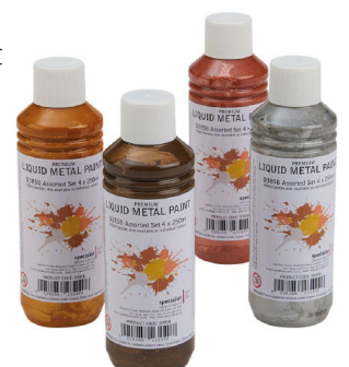
PD385B Liquid Metal Paint Set