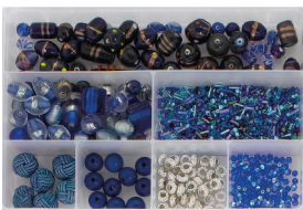
CR189A Bead Kits