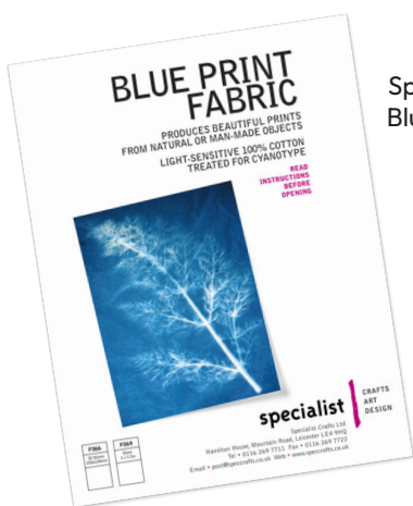
PB080 Specialist Crafts Blue Print Fabric